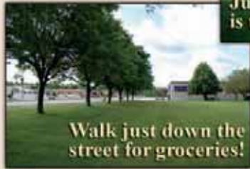
Walk just down the street for groceries!