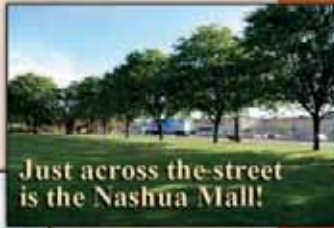
Just across the street is the Nashua Mall!